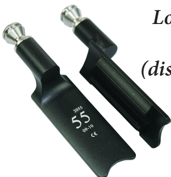
Longitudinal Blades 55mm (distractor arm length)