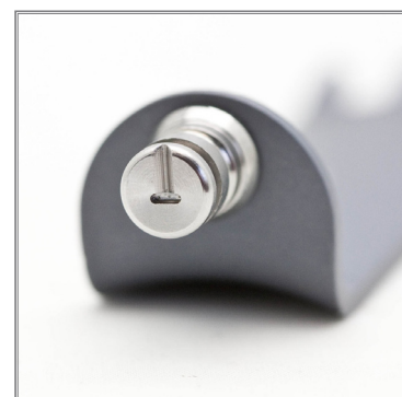
Innovative Alignment Groove