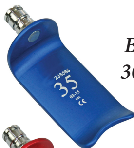
Blunt Blades 30mm-75mm