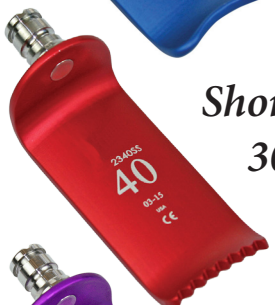
Short Teeth Blades 30mm-65mm