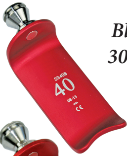
Blunt Blades 30mm-65mm