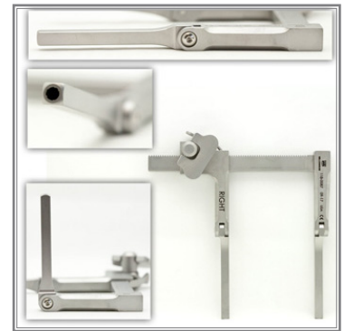
Reversible Distractor (Left / Right)