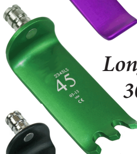
Long Teeth Blades 30mm-65mm