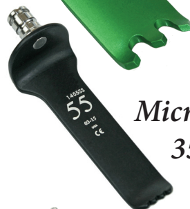
Micro-Teeth Blades 35mm-65mm