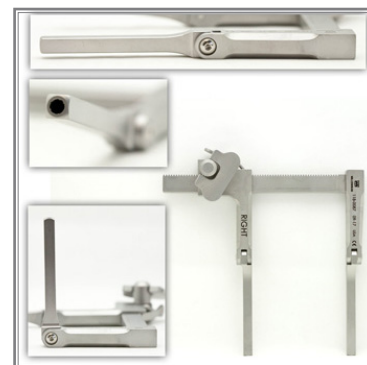
Reversible Distractor (Left / Right)