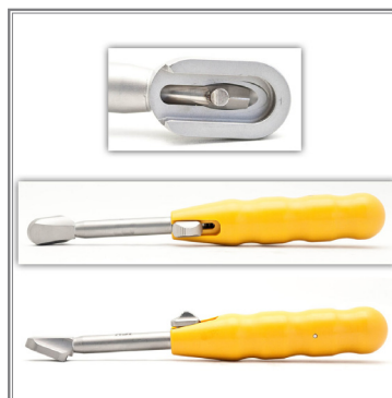
Quick Release Handles