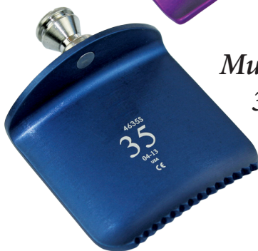
Multi-Level Blades 30mm-65mm