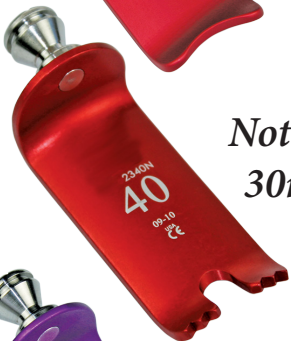
Notched Blades 30mm-65mm