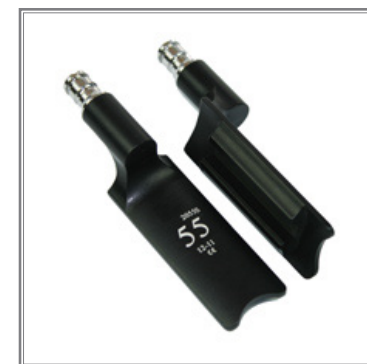
Longitudinal Blades 55mm (distractor arm length)