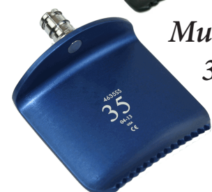
Multi-Level Blades 30mm-65mm