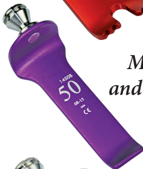
Micro-Blunt Blades and Micro-Teeth Blades 35mm-60mm