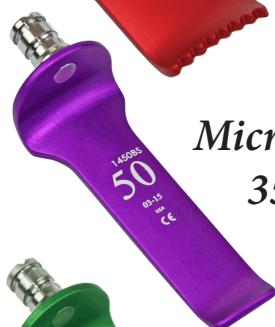
Micro-Blunt Blades 35mm-60mm