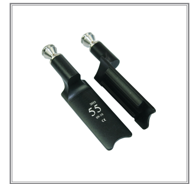
Longitudinal Blades 55mm (distractor arm length)